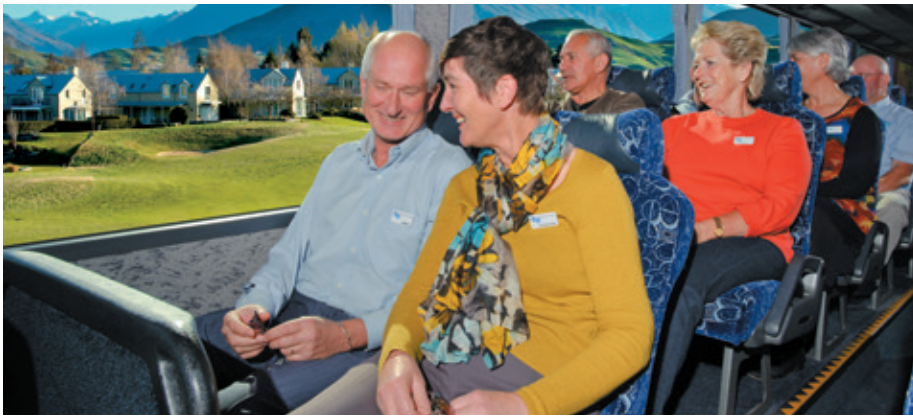
CLOCKWISE FROM TOP LEFT: Enjoy spectacular views from the Skyline Rotorua; cruise aboard the vintage steamship TSS Earnslaw to Walter Peak; visit Larnach Castle where you hear of the tragic and scandalous history on a guided tour; panoramic windows allow you to view the spectacular scenery.