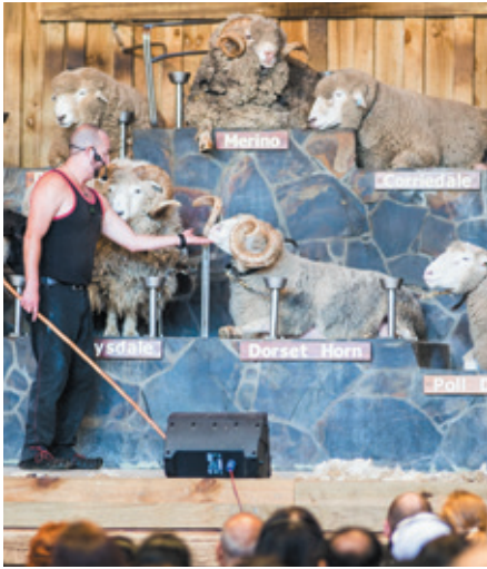
TOP TO BOTTOM: The Pohutu Geyser in Rotorua; Agrodome, an educational hands on experience.